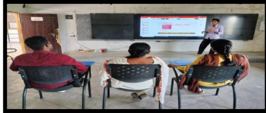
Students are teaching with ICT in Classroom