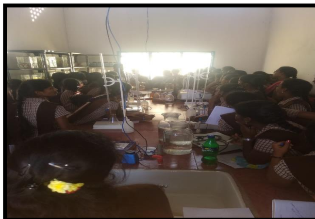
Fig: students and Teachers in laboratory classes