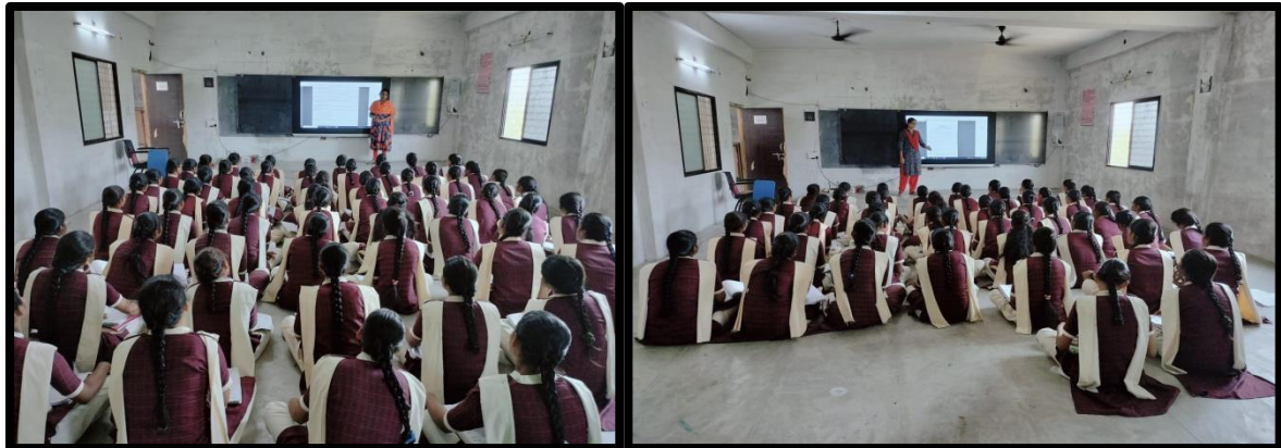
Lecturers are teaching with ICT in Classroom