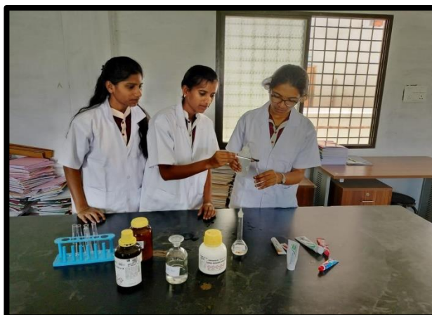
Fig: students and Teachers in laboratory classes

Enough equipment is available for each student to do practical individually.